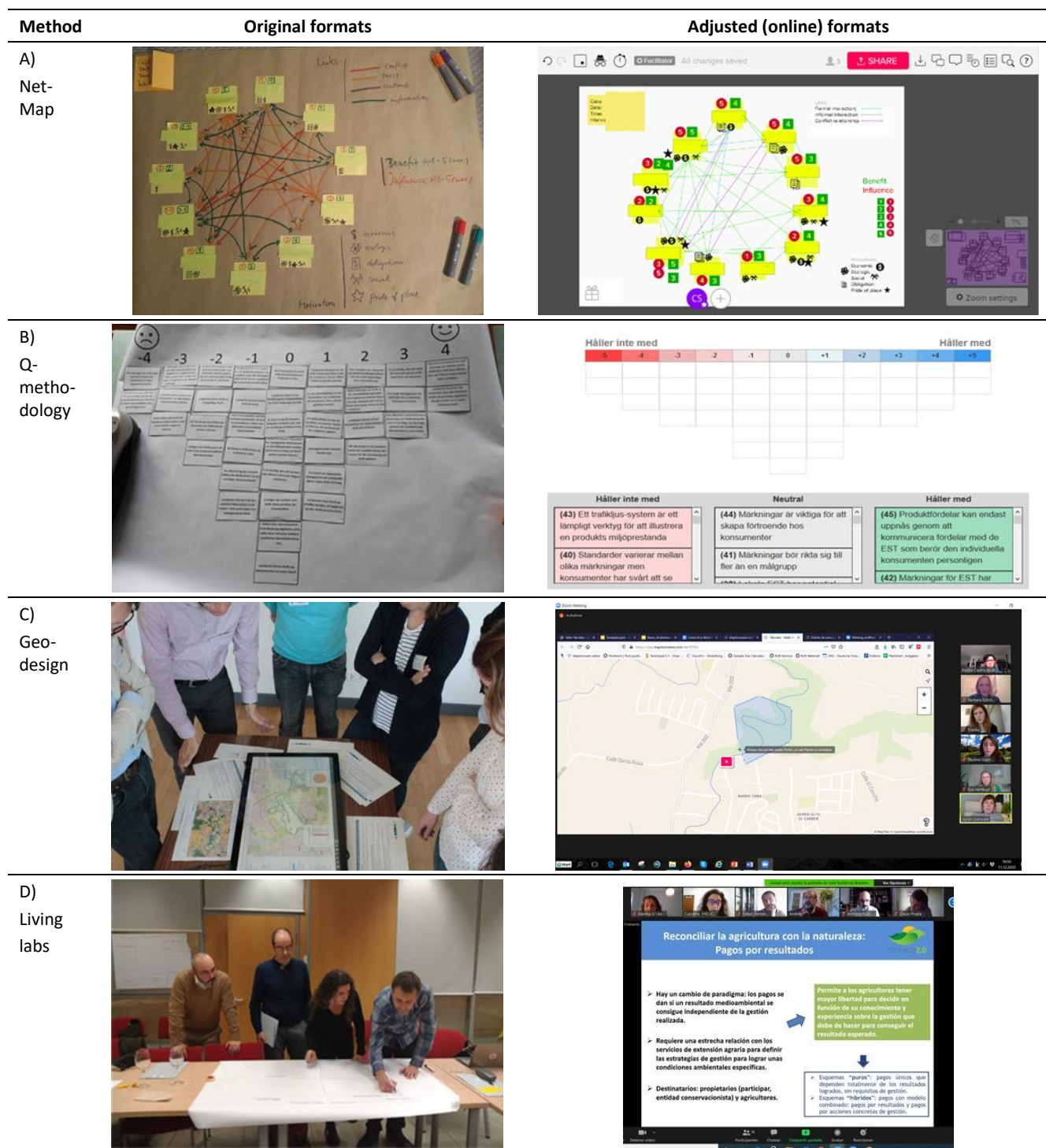
Figure S1: Visual comparison between the original vs. the adjusted format for four of the selected methods. A) Net-Map, B) Q-methodology, C) Geodesign, and D) Living labs.