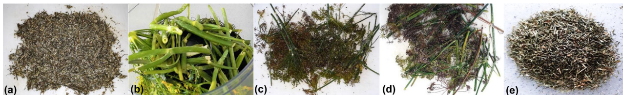
FIGURE 1 Samples of the dill variants from different harvest months and years: (a) August 2017, (b) late June 2018, (c) mid-July 2018, (d) late July 2018, and (e) commercially dried

with these spices in their commercial weight but with different dill variants. A storage period of three months and the quantities of enzymes measured in the pickled cucumbers should provide a definitive result about the correlation between the spices used and fruit softening.