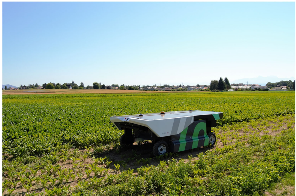
Fig. 1 Autonomous weeding machine (AVO) from ecoRobotix.