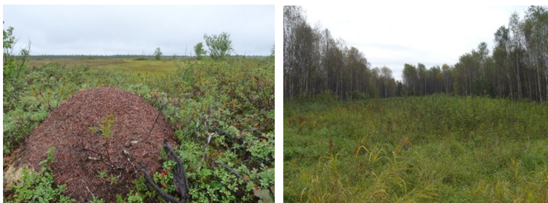
Figure 1. Peatlands in the Southern Taiga a) Natural bog with anthill of Formica spec. These ants are very important for biological preventing of insect calamities. b) Cultivated and abandoned peatland

The West Siberian lowlands are the world's largest high-latitude wetland region including vast and deep peatlands. Sheng et al 2004 estimated the total area of peatlands in West Siberia at 59.2 Million ha and the total carbon pool at 70.21 Pg (Petagrams= Billion tonnes). The Vasyugan Mire is the largest of them covering an area of 5.3 Milion hectares (Inisheva et al 2011). Humid Taiga and Tundra of Siberia are regions of permanent peat accumulation and thus a permanent natural carbon sink. From recent models based on numerous measurements, sphagnum mosses grow up about by 12 mm/yr. in the northern Taiga, 16 mm/yr. in the middle Taiga and 12 mm/yr. in the southern Taiga. The annual carbon accumulation ranged from 90-160 g/m 2 (Dyukarev et al 2011). Inisheva und Berezina (2013) report on an increasing peat layer by about 0.4-0.7 mm/year and quote an enlargement of the peat area of 92 km 2 /year based on data of Neistadt (1971). Also in the warmer Sub- Taiga of south Siberia, Larin and Guselnikov (2011) found an annual increase of wetland areas by 4.6 km 2 and year.