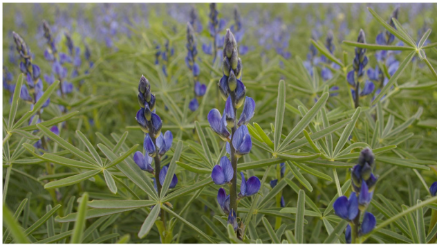
Fig. 1 Narrow-leaved lupin ( Lupinus angustifolius L.) grown in a long-term field experiment in northeastern Germany.

all found lower yield stability in a range of grain legumes than in cereals.